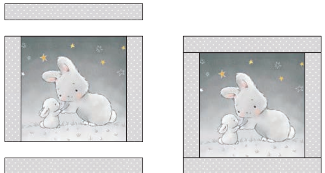
Block B Make 6.