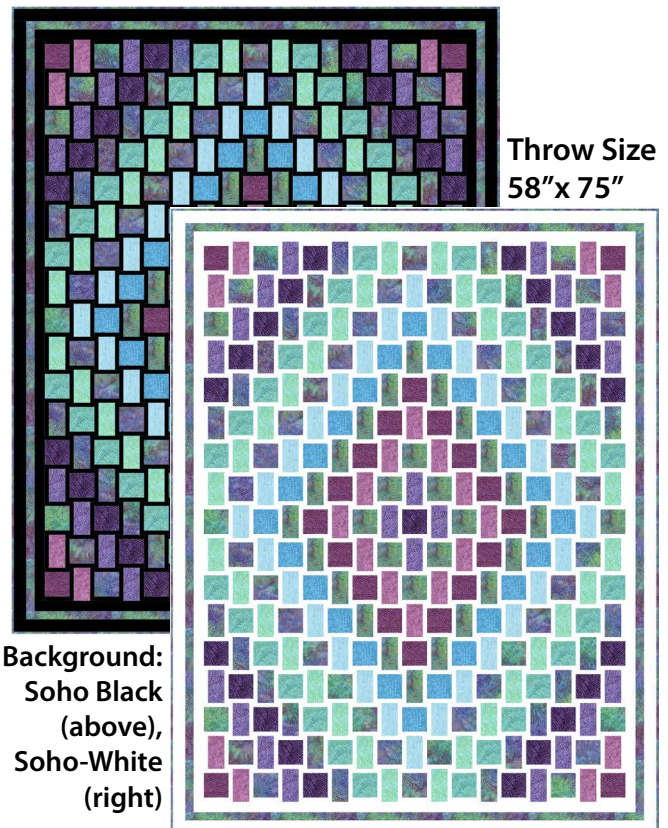
Throw Size 58" x 75"

Total yardage for 1 quilt (not including backing): 8