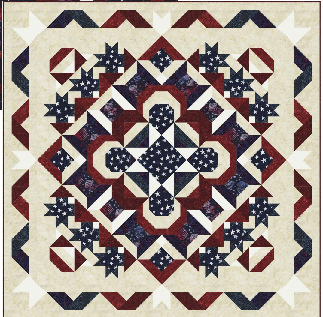
Medium: 72" square